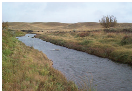
Riparian area one year after installation of water system – health significantly improved.

The Morviks installed a floating pump to move water out of the river and up the valley in a pipeline to a set of troughs on the upland grass. The project cost $8500, with 50% paid by SWA. The benefits were immediate. Increased utilization of the upland grass allowed the Morviks to increase their flock by 10 to 15%, and lamb weaning weights increased by 7 to 8 lbs per lamb. Dwane estimates that their investment was recouped in three years. The riparian area along the river recovered quickly, benefiting the river ecosystem as well as providing quality forage for the sheep during times when weather conditions confine them to the valley. The result – a healthier river and a more profitable agricultural operation.