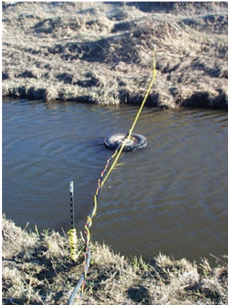
Riparian area at the time of pump installation.

The Frenchman River Valley has often been described as the lifeblood of southwest Saskatchewan's biodiversity. It flows through Saskatchewan's largest area of native prairie, which remains intact due to a predominance of ranches. These large tracts of native prairie also support the largest remnant populations of terrestrial species at risk in the province.