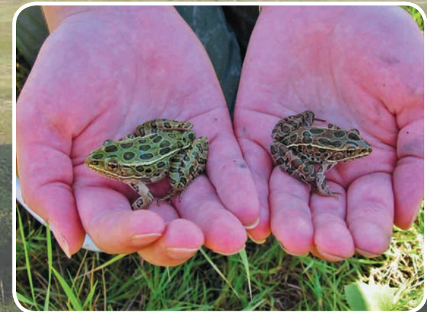
Northern Leopard Frog

For more information on species at risk or to participate in Stewards of Saskatchewan, please call 1-800-667-HOOT (4668)